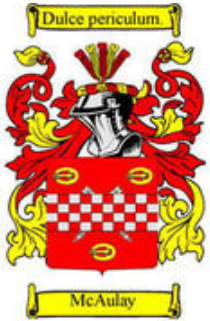
Catherine McAulay Scholarship