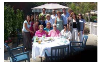
School on Wheels, Staff, Board Members, Tutors and Friends 15th Anniversary Celebrations, Paradise Cove, Malibu August 21st 2008