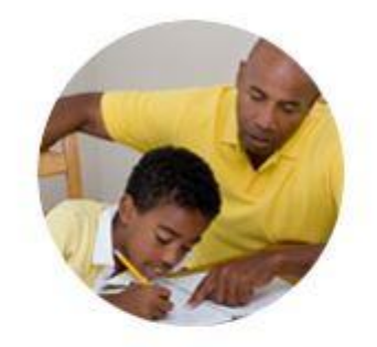
Academic Program (K-7th Grade)

Curated resources and learning materials to use with students in grades K through 7.